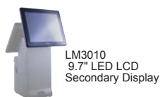
LM3010 9.7" LED LCD Secondary Display